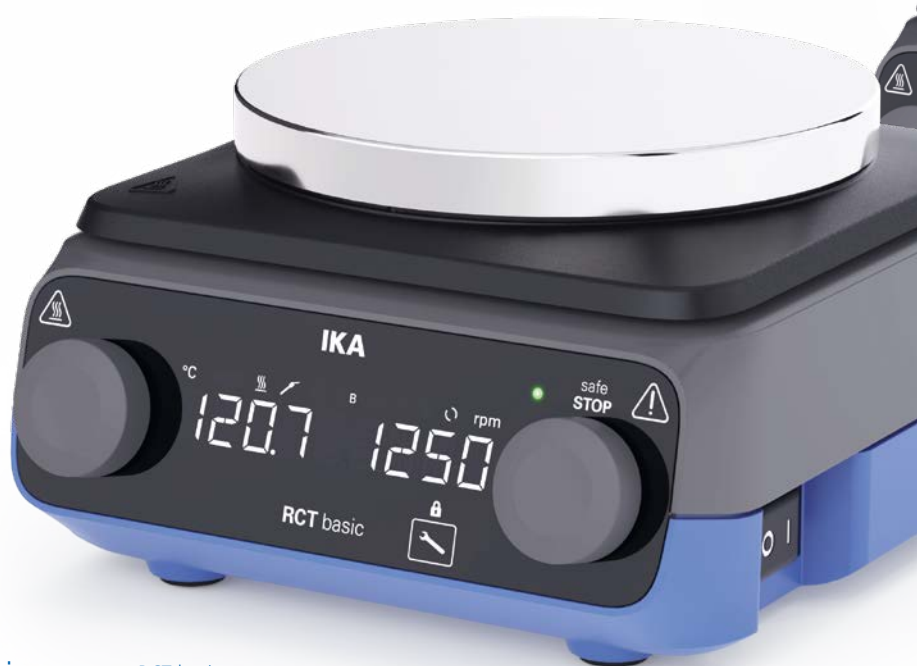
RCT basic Ident. No. 0025008259