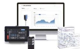
DIGITAL LAB SERVICES