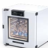
HEATING / COOLING / TEMPERING